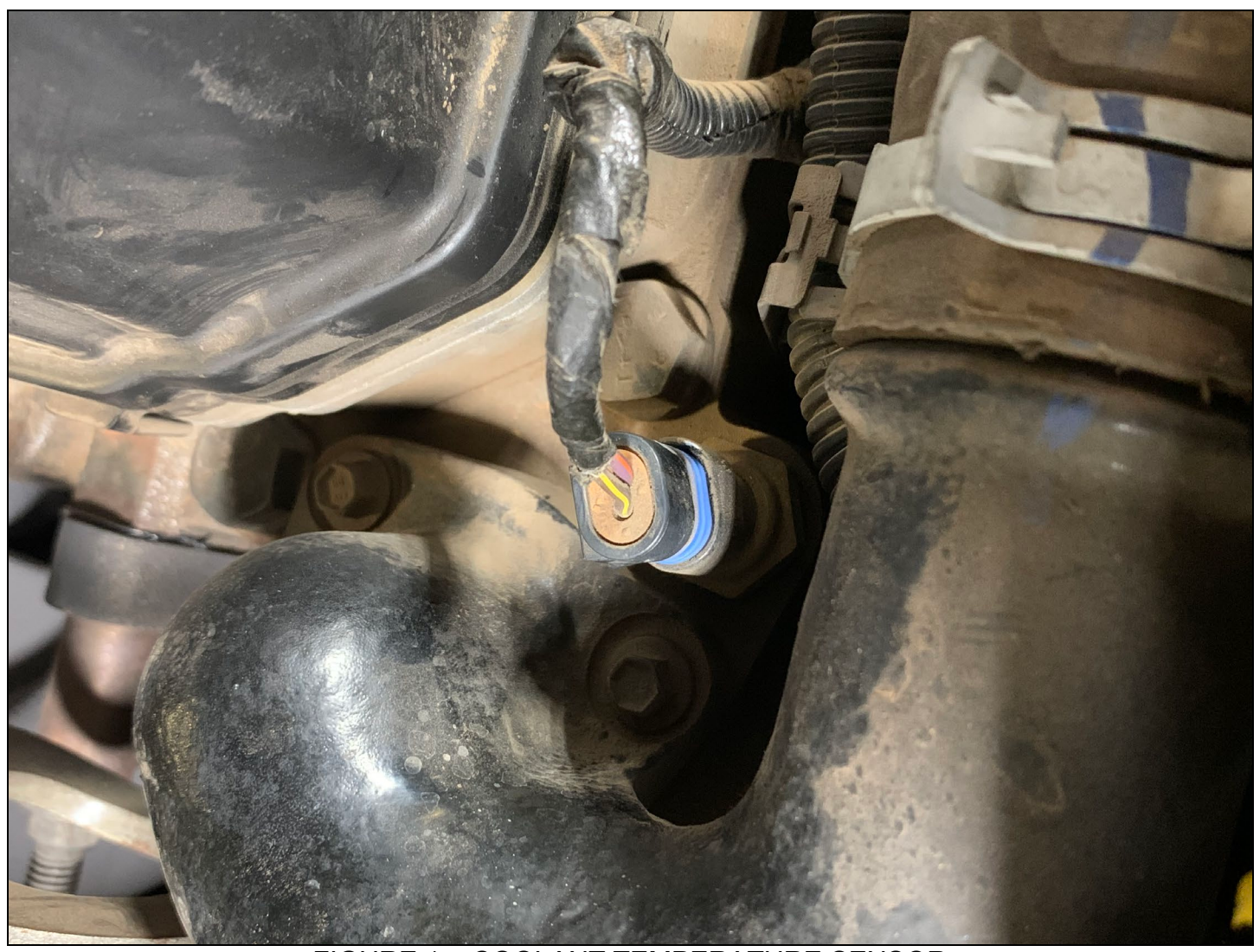
FIGURE 1 – COOLANT TEMPERATURE SENSOR

Congratulations on completing the installation of the Driven Diesel Fan Accelerator Harness.