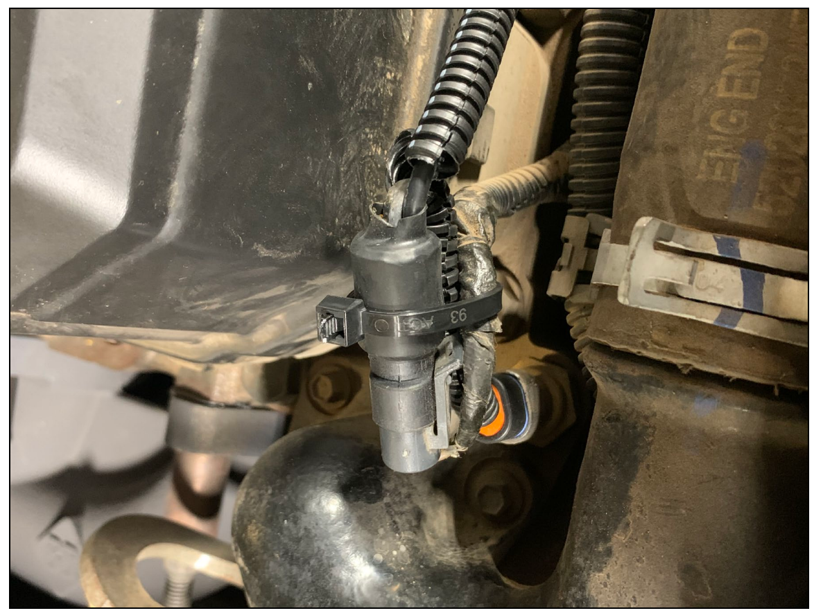
FIGURE 3 – WIRING SECURED AT COOLANT TEMP SENSOR